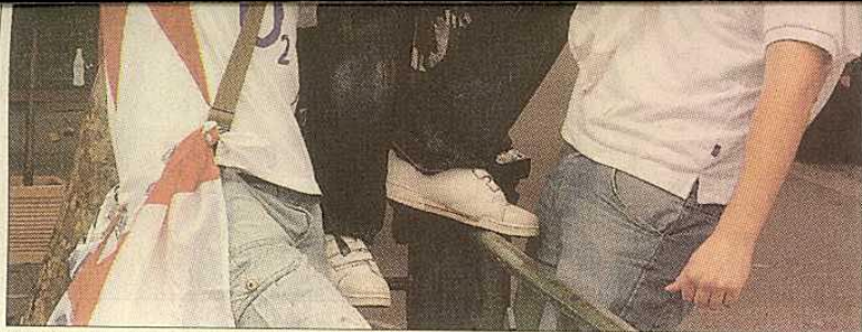
Metro men: England fans in Paris for last weekend's World Cup semi-final against France

nt to iring an not time. ay, ownside is to Paris. antes remouth, rs, ons, 257 from miles